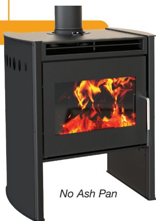
No Ash Pan